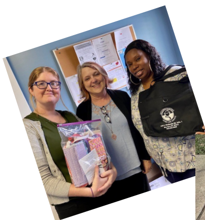
Accommodating Home Care Services—"your generosity goes a long way."

Congregate living environments present one of the biggest challenges to those who are trying to prevent the spread of COVID-19. Those who give and receive services through in-home health agencies also are at risk. Assisted living facilities and in-home health agencies are working hard to serve people and protect them. They are grateful for the extra support offered by the community.