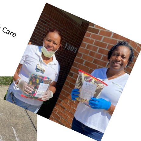
Pruitt Health Care